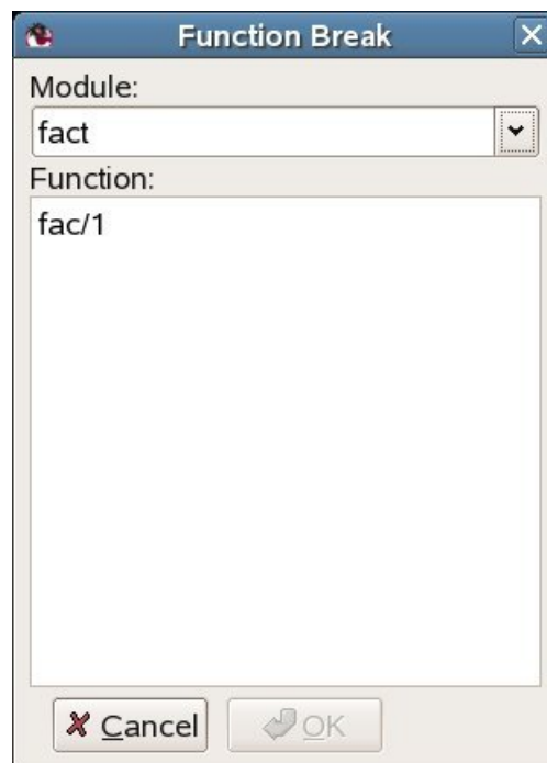
Figure 2.3: Function Break Dialog Window

A function breakpoint is a set of line breakpoints, one at the first line of each clause in the specified function.