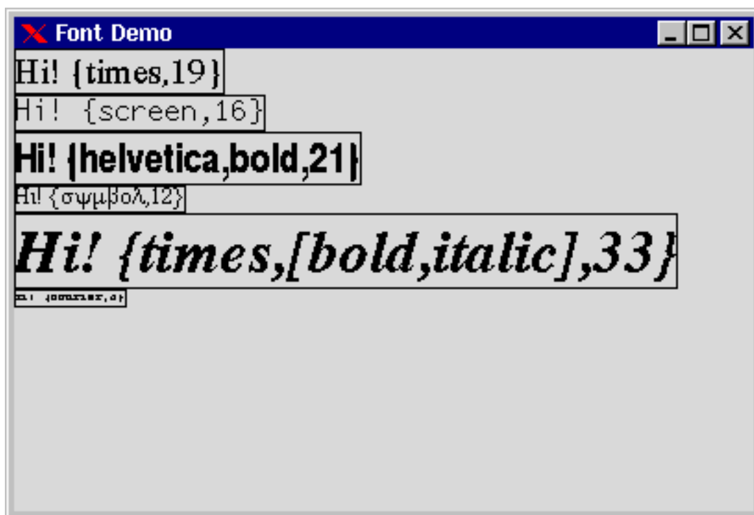
Figure 5.1: Font Examples

When programming with fonts, it is often necessary to find the size of a string which uses a specific font. {font_wh,Font} returns the width and height of any string and any font. The following example illustrates its usage: